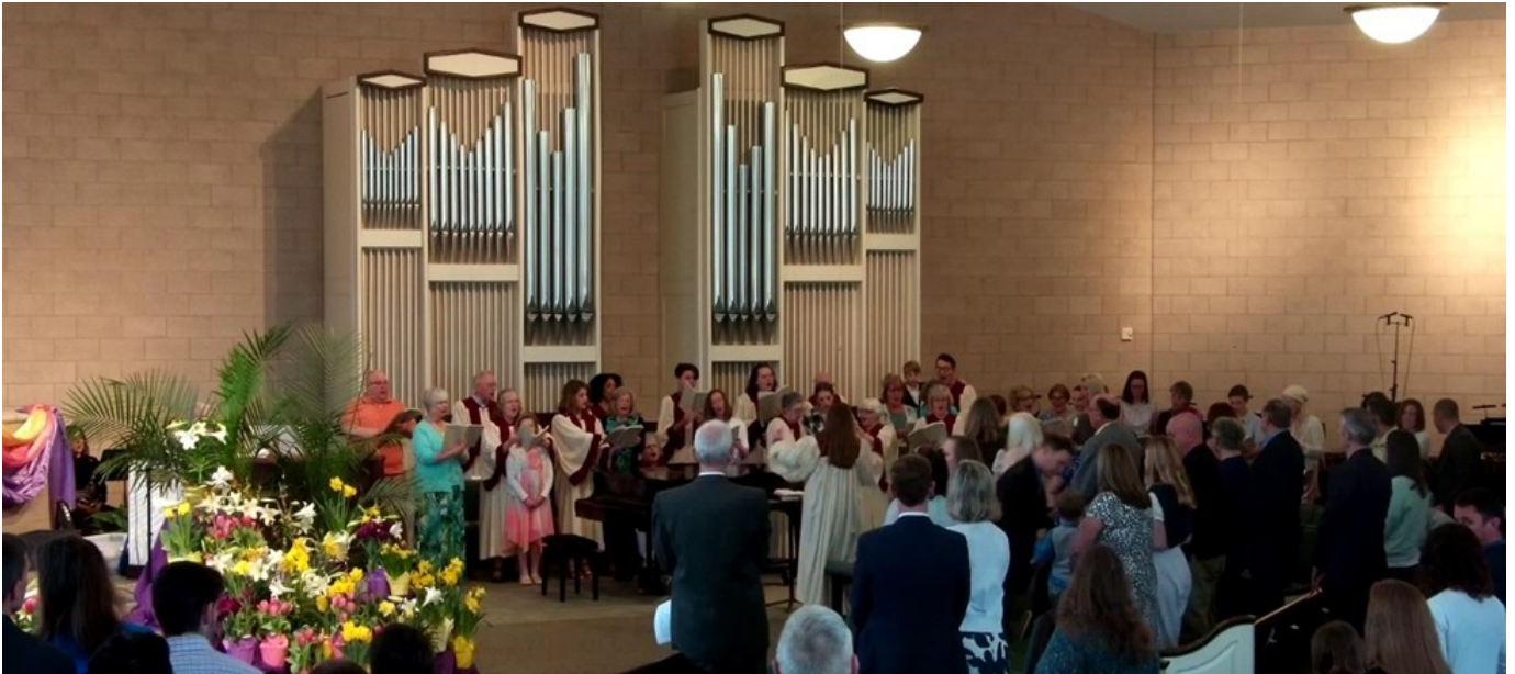
Above—Continuing a beloved tradition, the congregation joined the Chancel Choir in singing the ‘Hallelujah Chorus’ from Handel’s Messiah at the conclusion of the Easter morning worship service on April 9.

April saw the PCO congregation celebrate Christ's Resurrection at Easter, engage in a battle of minds during the UKirk Trivia Night, and dedicate the church's solar panels. Further reaffirming the church's status as an Earth Care Congregation of the PC(USA) the Green Team led the entire worship service on Creation Care Sunday.