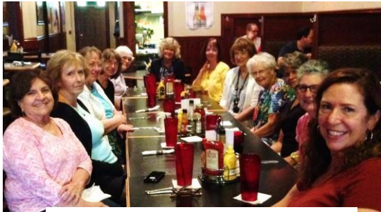
Women's Dinner Out