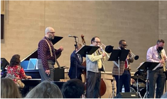
A Jazz Quintet led the September “Jazz Sunday” service

Jazz Sunday is held before the beginning of Lent, traditionally the time of Mardi Gras. The Sunday morning worship service highlights jazz selections relating to the liturgy and sermon. We include Jazz, Gospel, and Folk music in our worship at other times during the year.