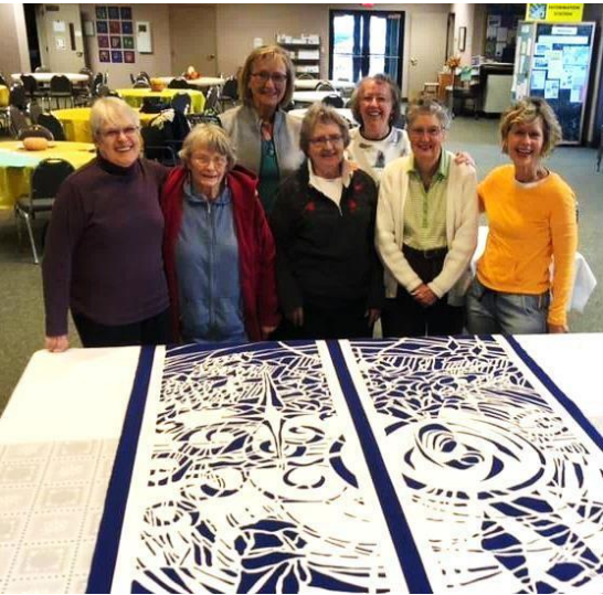
Artist's Circle with their completed Advent banners (above). Learning about native plants with the Green Team (below)

Women's Connection meets monthly September to May (excluding December). We enjoy lunch provided by group members, join in a devotional time, then hear a presentation of a PCO member's life and faith journey. Our goal is to build closer relationships among PCO women as we get to know each other better and learn of, are inspired by, the life experiences and faith which have formed us, and strengthen our personal faith.