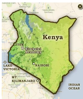
Simbolei Academy for Girls