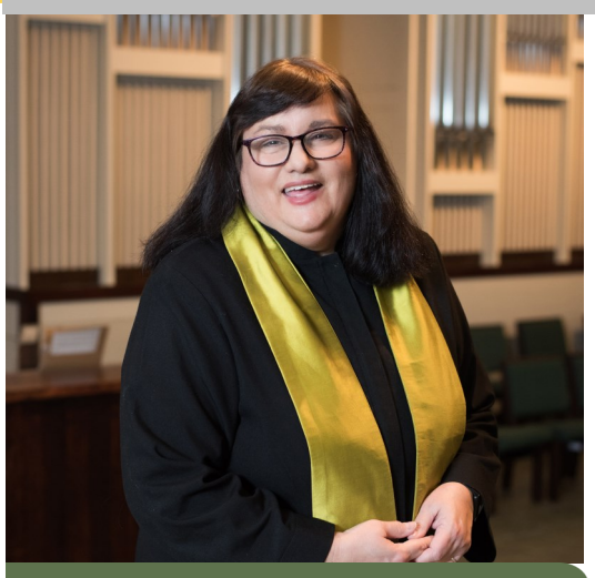
INSIDE this issue