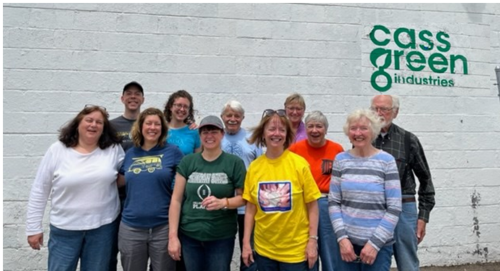
Mission Group to Cass Community Services

The Mission committee plans to continue providing support to those in need, both locally and globally. The committee will continue to provide educational opportunities for the congregation as well. The Mission committee is organizing a June 2023 Mission trip for both youth and adults to Simbolei Academy in Kenya. The committee will continue to pursue opportunities that will engage both youth and adults in hands-on mission activities.