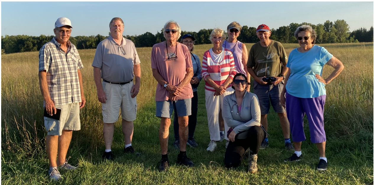
Caring for Community

Adult Education will continue to follow our four theme areas by considering topics that help us care for self and community, applying the Bible to our lives; growing our faith formation in Christ; and equip us for action in the world. The events will continue and expand these themes while coordinating with mission and youth.