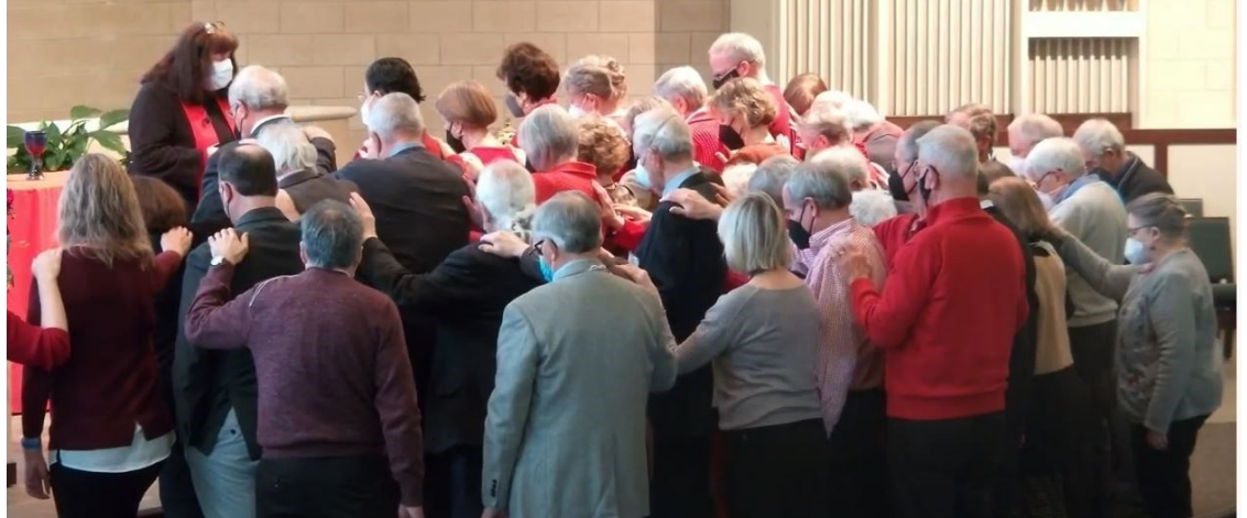
The congregation prays for the newest Deacons and Elders

The committee plans to continue its role of identifying church members who can best represent and serve the church in the various leadership roles.