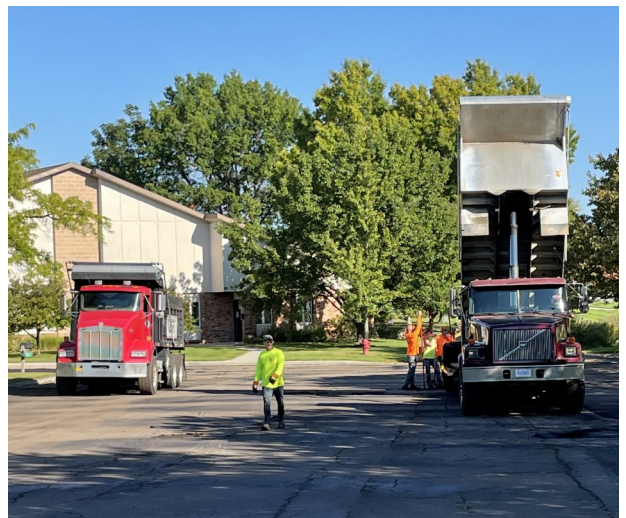
Resurfacing the Parking Lot

The committee spent significant time this year updating the bylaws, policies and procedures for management and operation of the Memorial Fund which were approved by Session this Summer. The committee also reviewed and updated the Endowment Fund by-laws which were approved by Session and will be brought to the congregation for approval at the annual meeting.