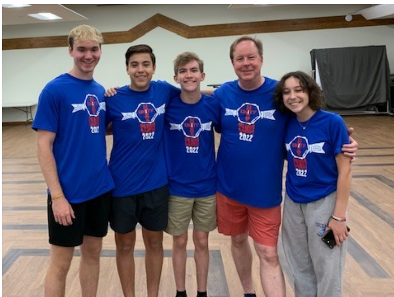
Youth Mission Team to Cuba

Perhaps the most exciting youth activity in 2022 was a youth mission trip to Cuba in June. Four of PCO's youth joined with Holt Presbyterian Church youth to provide a Bible School program for Cuban youth and to assist with some community repair activities. This fall, the youth who participated in the mission trip led a Sunday worship service with a Cuban theme and conducted a Q and A session during the education hour.