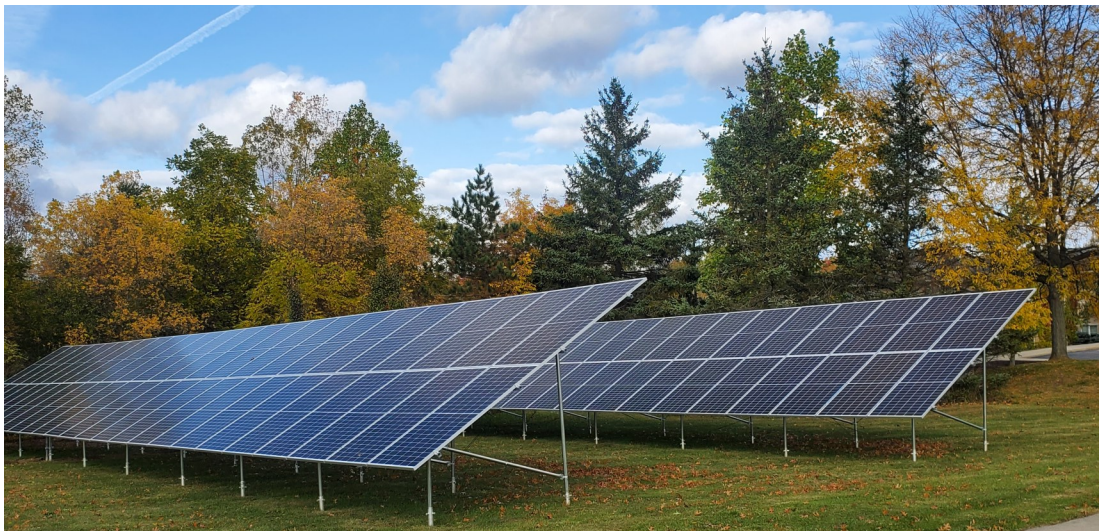
Solar panels in the church yard along Okemos Road

The Administration committee develops and monitors the annual budget, and has oversight responsibility for legal issues, insurance, and building and grounds. In addition, this committee supports acquisition of technology needed by the church to continue its services as we move beyond the pandemic. All of this enables the congregation to accomplish the ministry of the church Together for Joy!