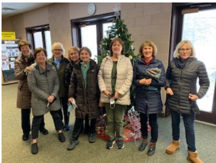
Ready to Shop for the Giving Tree

The committee continues providing Thanksgiving baskets, and Christmas gifts through the PCO Angel Tree and hosting our Alternative Christmas market.