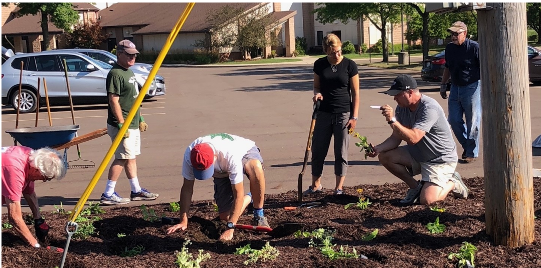
Planting the plants