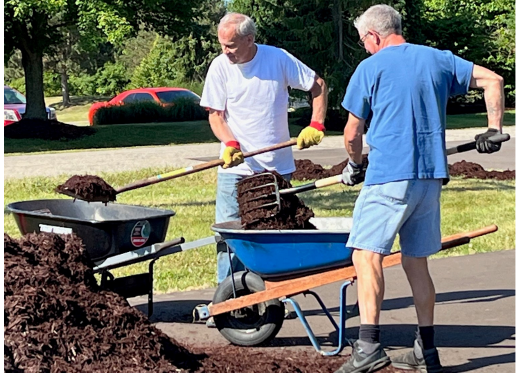
Preparing the ground

PCO made commitments to protect our earth and creation. In 2022 PCO carried out these commitments and is now a certified Earth Care Congregation. The church installed solar panels that will be ready for use in 2023; initiated a native plant project, collaborating with the MSU seeded plant plot project; increased recycling through a church composting program; and changed environmentally responsible commodities, ie. coffee and paper products, to protect our earth. The team worked to increase awareness of environmental issues and participated in activities with Michigan Interfaith Power and Light Area Chapter.