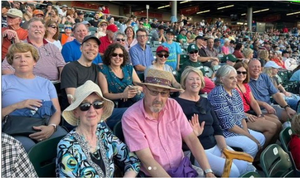
Lansing Lugnuts Game Out on the Town Summer Fellowship Initiative

In 2023, we hope to expand the ways in which we can meet in fellowship. We would like for church members to know what other members live close to them. We hope to revive favorite activities like the Chili Cookoff and to introduce new ideas, always mindful of health protocols that should be observed. We will welcome many of the church's small groups under our umbrella so that together we can better serve God in our community.