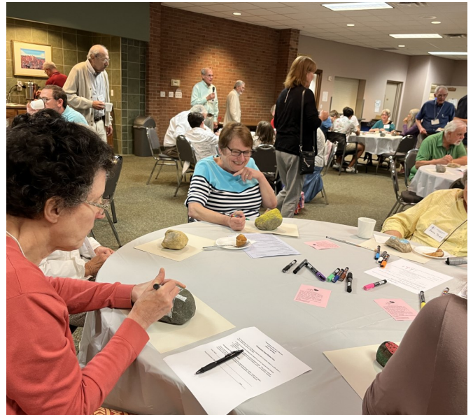
Intergenerational Art Project

PCO has several small group ministries that bring members Together for Joy in various ways. The Women's Connection, Men's Group, and Retirees Group create opportunities to gather Together for Joy . The Women's Connection highlights members' faith journeys, while the Men's group highlights faith and experiential issues. The Retirees Group focuses on personal changes and spiritual development as we grow older. The Contemplation Class brings members Together for Joy with spiritual practices of prayer, silence, and shared conversations. The Crafts Ministry (formerly the Prayer Shawl Ministry), the Artist Circle, and the Writing Group bring members Together for Joy , by creating for the church and community. The Crafts Ministry makes prayer shawls to share spiritual support to members and friends, and will begin making hats, mittens, scarves, and other items that are needed in the community. The Artist Circle explores faith through creating liturgical art for the sanctuary. The Writing Group shares writings of poems, letters, stories, etc.