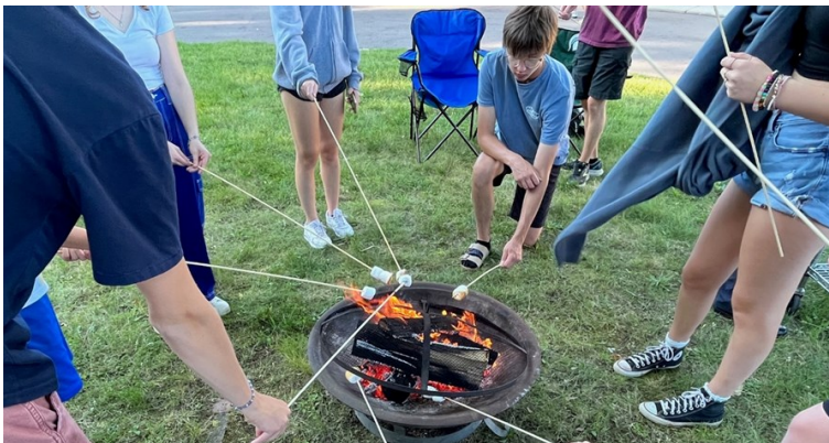
Small groups of differing ages and interests gather at the church building, online and out in the community throughout the year.