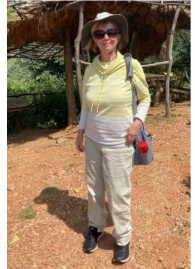
Serving in Kenya