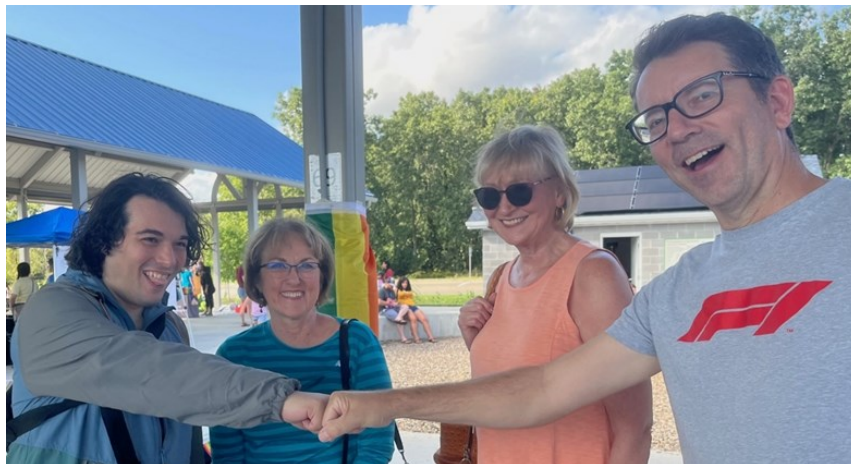
PCO is present at community events.