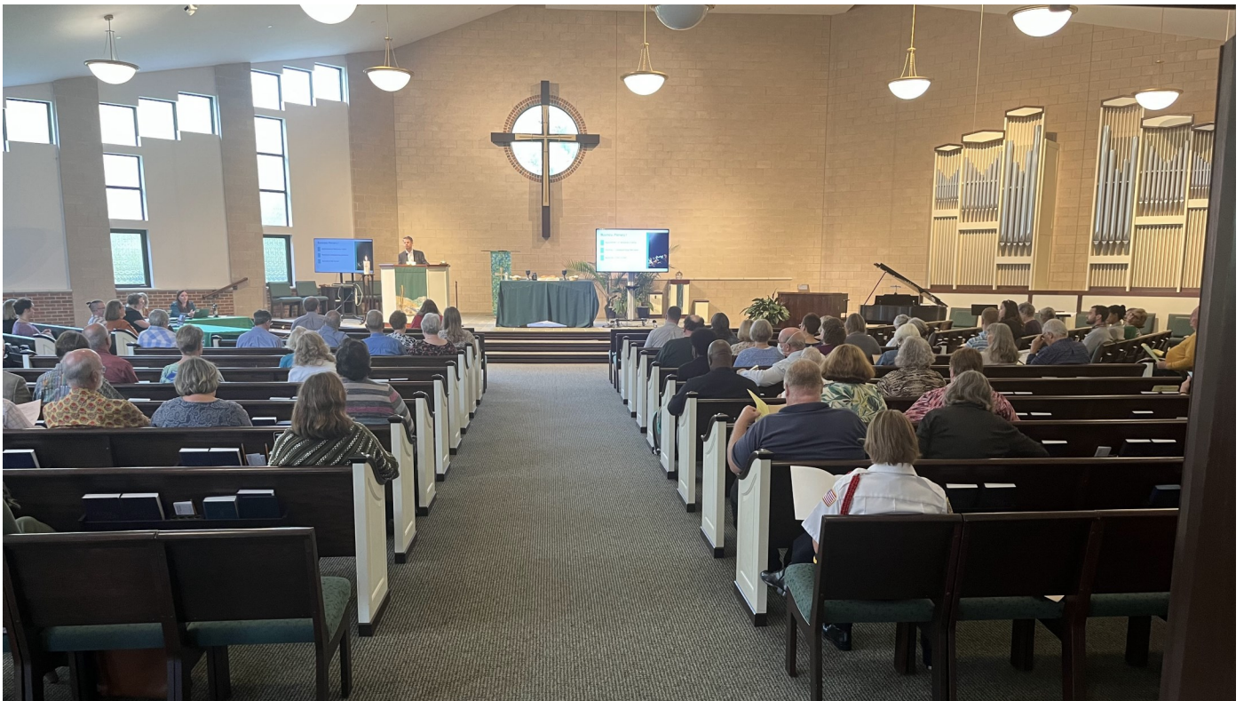
PCO hosting the Presbytery of Lake Michigan in September.

This fall's stewardship campaign entitled "Gratitude for the Past, Present, and Future" will focus on highlighting how, as a Christian Community, we have learned from those who came before us to minister both in the congregation and in the communities beyond our church. We strive to continue these opportunities through the present and going forward. We focus on how giving financial support and sharing our time and talents fulfills our call from God's to serve others.