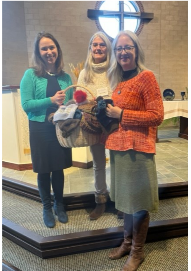
Members of the Crafts Ministry display items to be donated to those in need.

Small groups are organized by Parish Life. For more information, contact the church office.