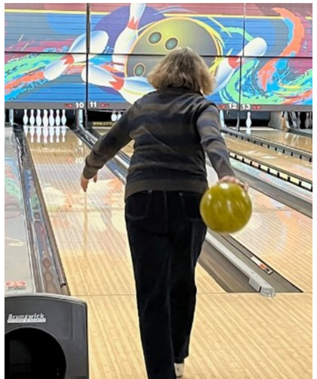
Out on the Town activities included bowling at City Limits in East Lansing

The goal of all of the Parish Life activities is to serve more faithfully through fellowship with and caring for one another. This will continue in 2024 with both traditional activities mentioned above and with NEW opportunities. Stay tuned!!