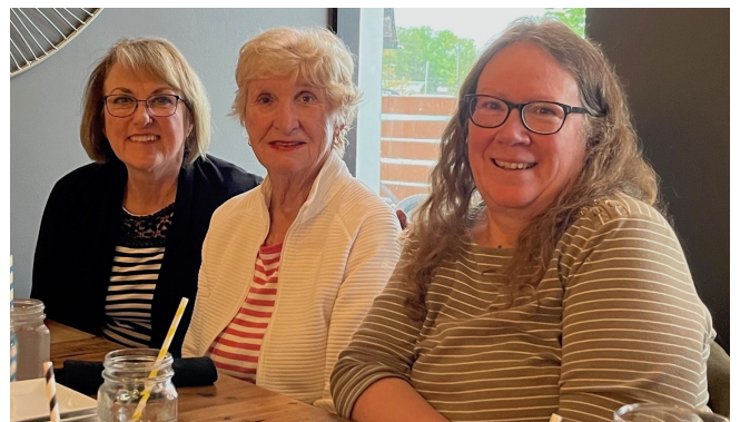
The monthly Women's Dinner Out gives PCO women a chance to connect with one another and to try new restaurants in the greater Lansing area.