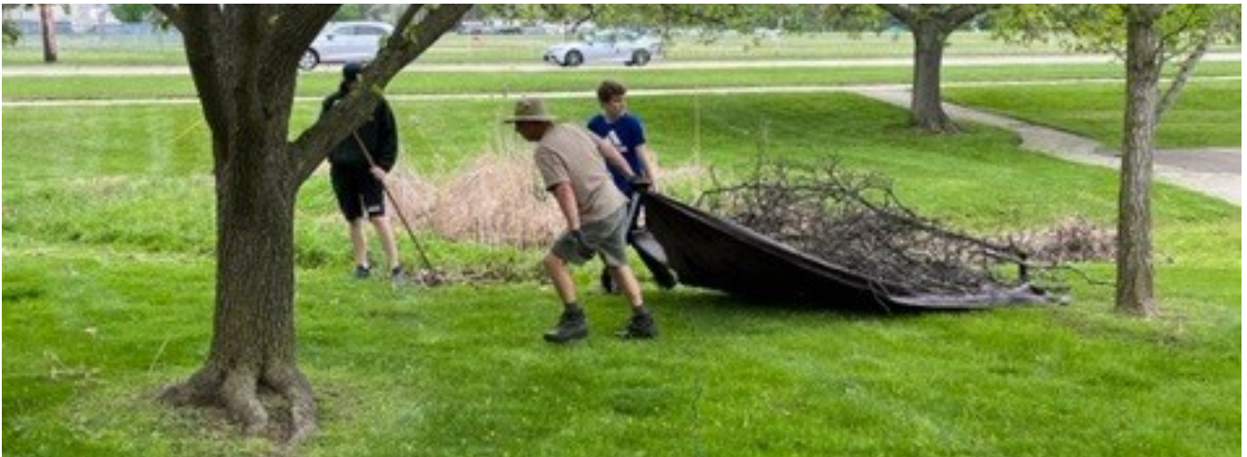
Hard at work on Clean-up Day

As our building ages, we continue to plan and ensure that all areas of our church are safe and well managed, and continue to handle financial responsibilities, including both on-going expenses and preparing for long-term expenditures.