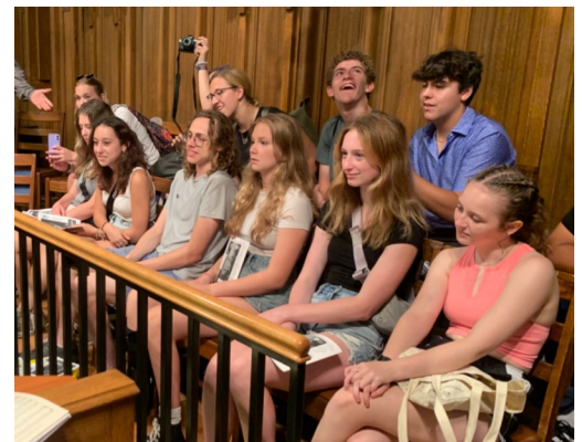
Preparing to serve in the Windy City

A major mission activity for the high school youth was the summer mission trip to Chicago. Youth worked with a program providing food for the homeless and needy, engaged in some small facility and grounds projects, and participated in worship services. Youth subsequently did a presentation on their mission trip during the adult Sunday School hour.