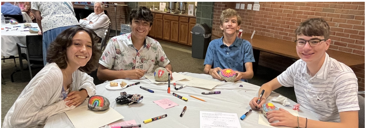
Painting Rocks was an intergenerational activity as part of education hour